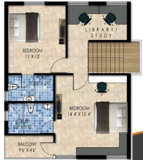
● FIRST FLOOR PLAN