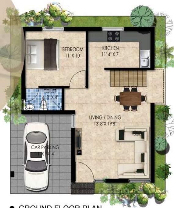
● GROUND FLOOR PLAN